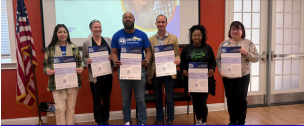
March 20, 2026 UWLC LTRG Meeting